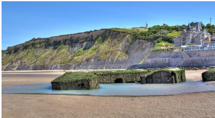
The artificial harbour of Arromanches-Les-Bains